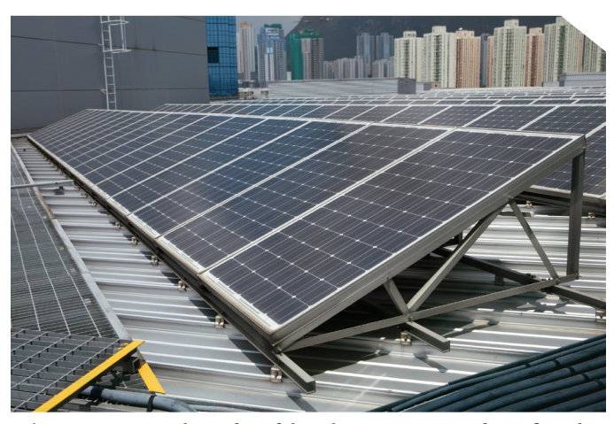
There are a multitude of local, community benefits that can be achieved as a result of place-based investing such as, but not limited to: job creation, revitalization, smart growth and affordable housing.